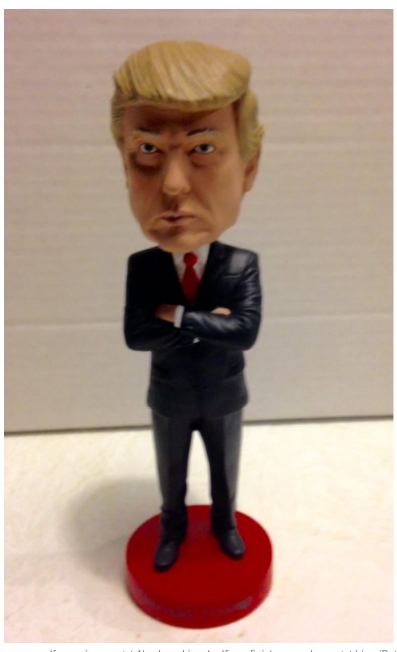
If you win, you get Abraham Lincoln. If you finish second, you get him.

In Week 1202 we asked for song parodies that expressed some kind of hope. If you've been in a funk since Nov. 8 but aren't the lyrical type (or even if you are) — or if you are happy with the election results but would like to buck up a funk-dweller: Note some good news for the coming year to comfort — or "comfort" — those who are depressed about the change of presidential administration.